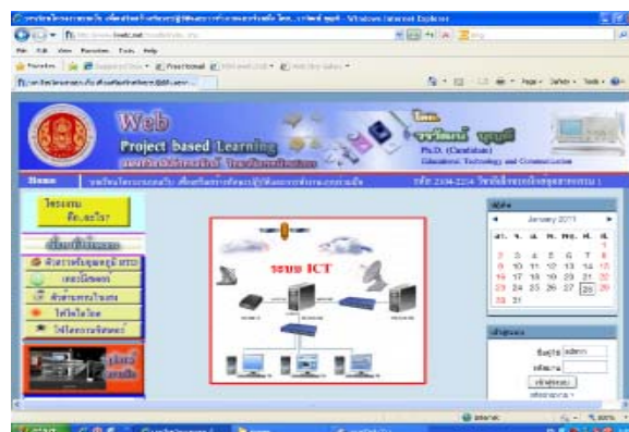
Figure 2: Example of Project Based Lessons on the Web